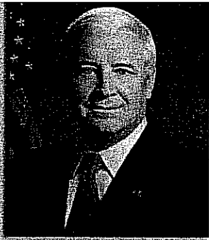
TOM CORBETT ATTORNEY GENERAL